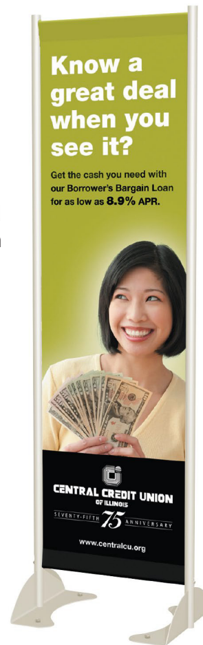
72" tall banner