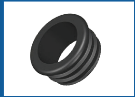
DOCK POLE BUSHING Item# DP-DPB

Dori Poles and Pennants – "See separate brochure"