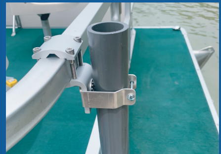
PONTOON MOUNT Item# DP-PMKT