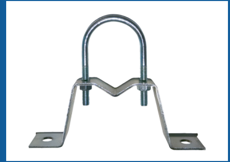
DOCK MOUNT BRACKET Item# DP-DM