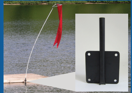
JR MOUNT PLATE Item# DP-DMJ